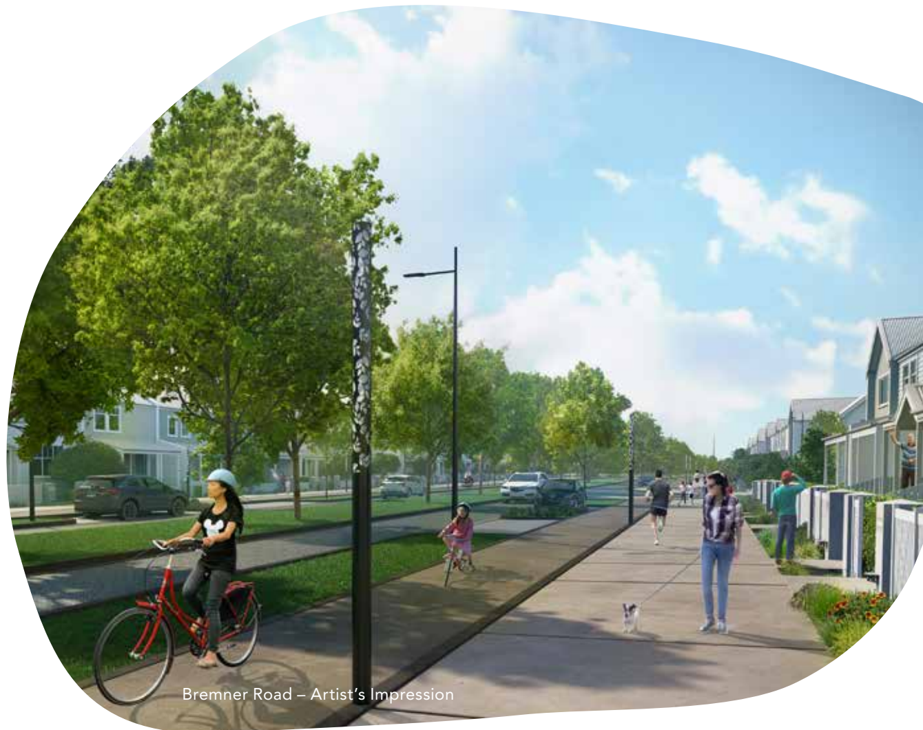
Bremner Road – Artist's Impression

Remember when kids played freely around the neighbourhood? When neighbours knew each other by name.