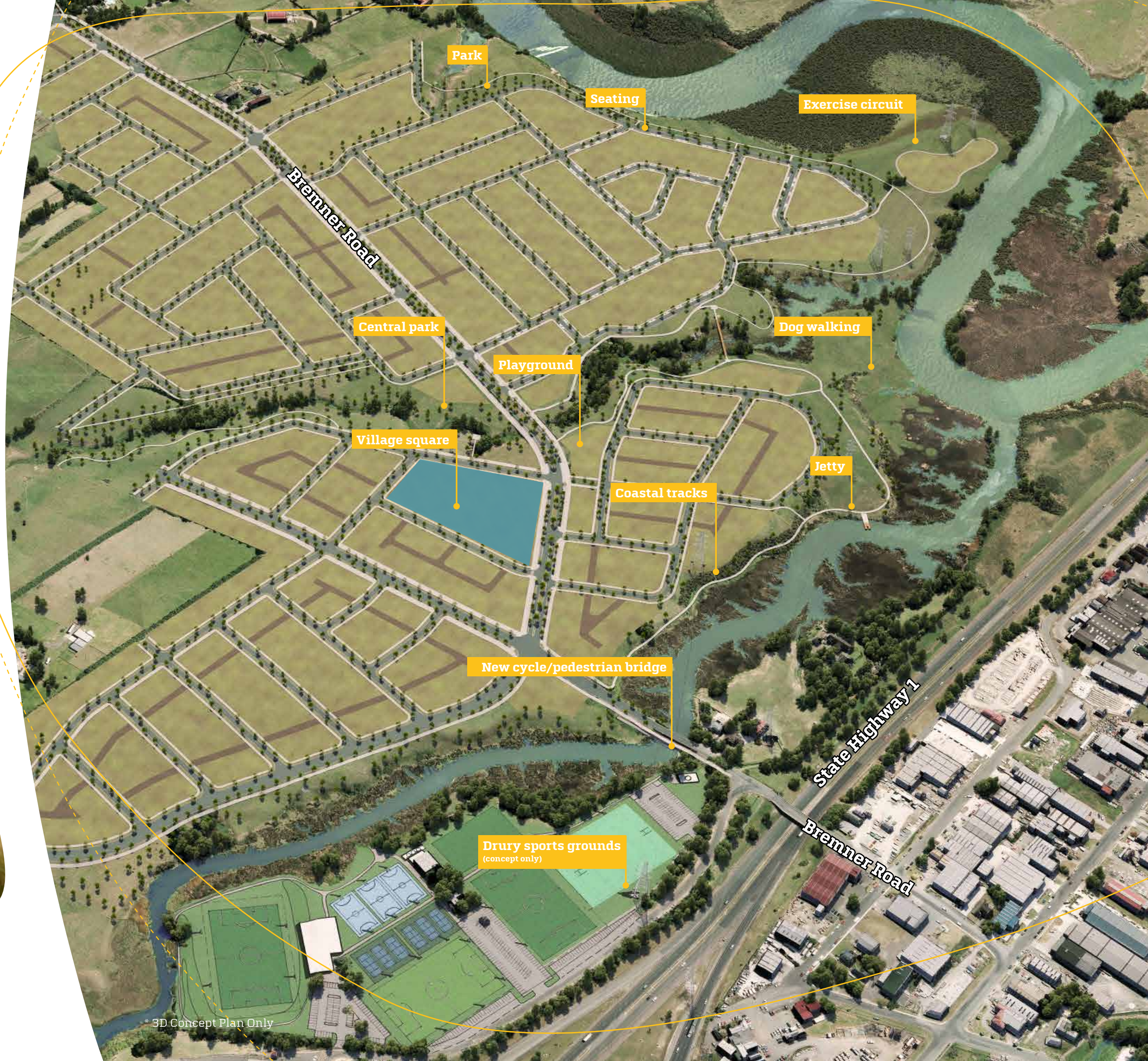
* 3D Concept Plan Only